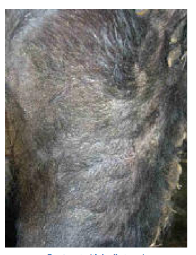
Treatment with Agnihotra ash wounds heals within a few days