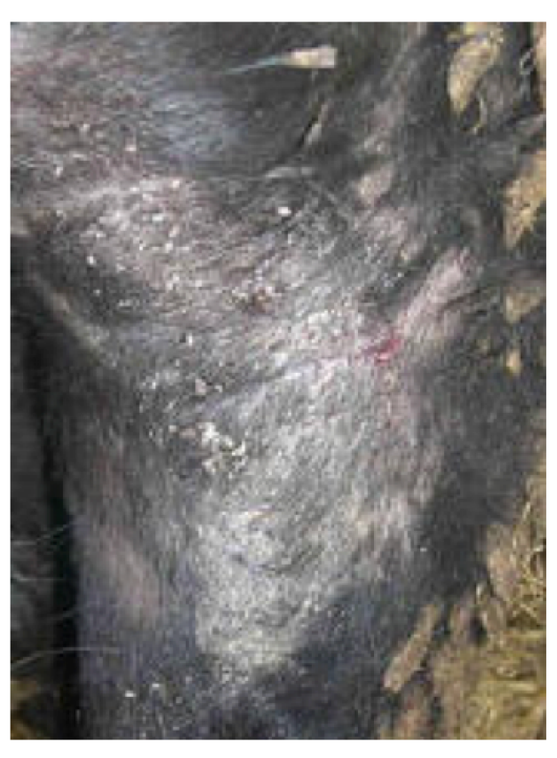
Chronic skin irritation for many years

Two years ago she also came to India for exchange of experience.