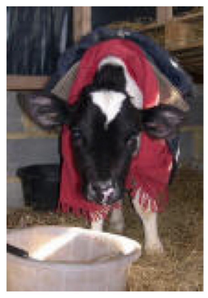
Young bull nearly dying when he came to the farm